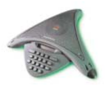
Large room system

SoundStation Premier with mic ports and infrared remote (Available options include: extended hypercardiod mics, wireless mic system)